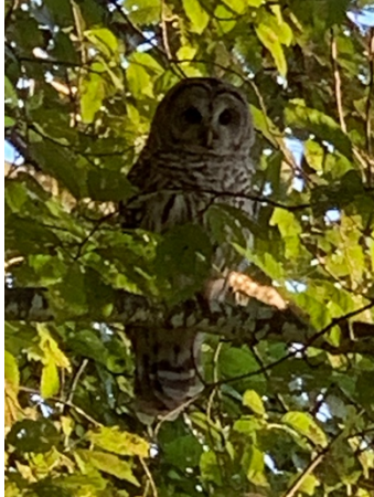
Hootie the resident owl

TOTALS for August vs AVERAGES (April to August)